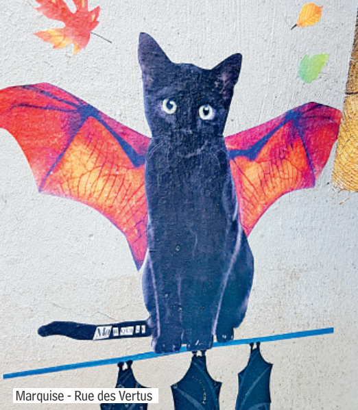
Marquise - Rue des Vertus