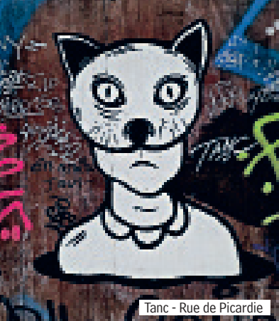
Tanc - Rue de Picardie