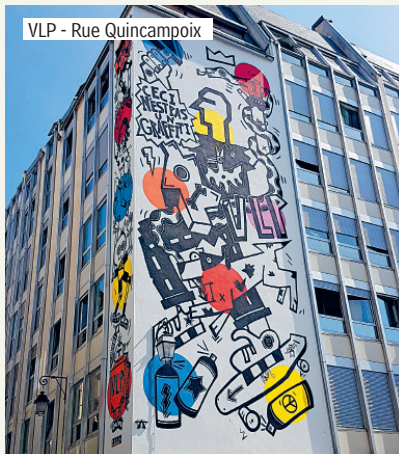
VLP - Rue Quincampoix

↘ Turn left where you will see the work of VLP 16 and go to the corner of Rue Saint-Martin and Rue du Cloître-Saint-Merri 17 to discover the latest artist's sculpture, an initiative that is part of the Embellir Paris project.