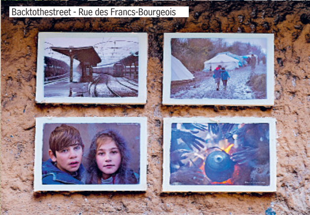
Backtothestreet - Rue des Francs-Bourgeois