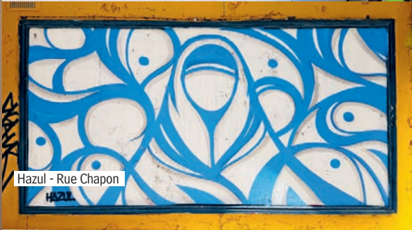
Hazul - Rue Chapon