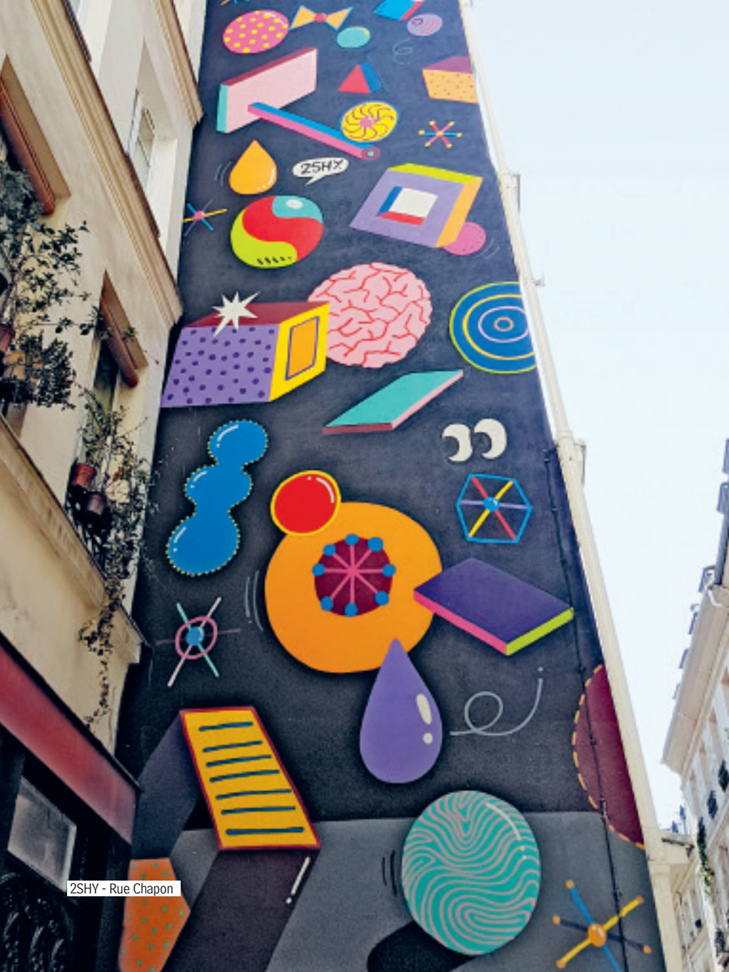
2SHY - Rue Chapon