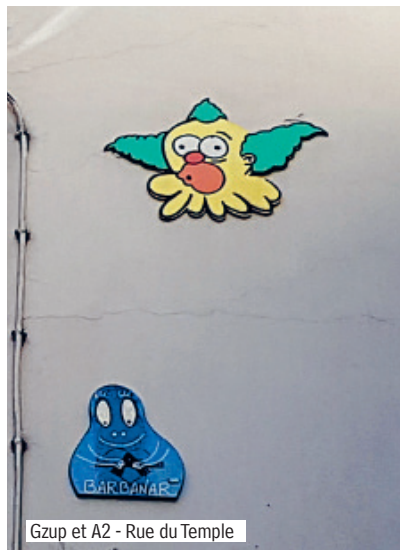
Gzup et A2 - Rue du Temple

4 Rue Eugène-Spüller 75003 Paris urbanartfair.com