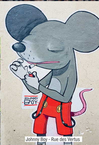
Johnny Boy - Rue des Vertus