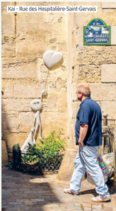
Kai - Rue des Hospitalière-Saint-Gervais