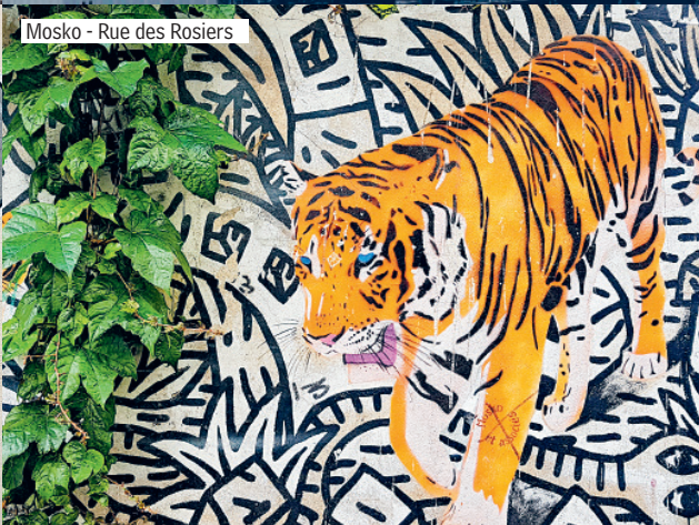
Mosko - Rue des Rosiers