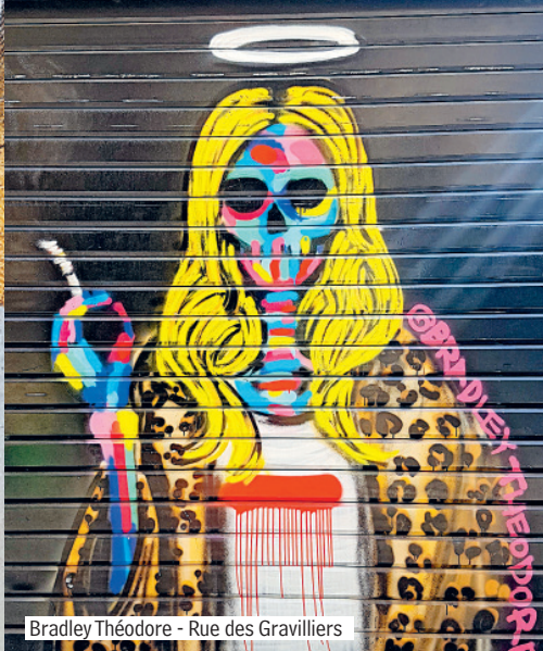
Bradley Théodore - Rue des Gravilliers