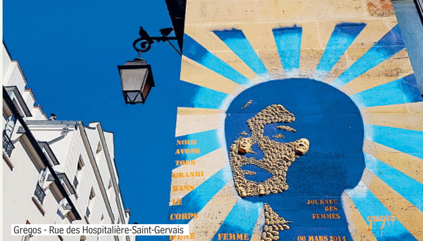
Gregos - Rue des Hospitalière-Saint-Gervais

➤ Continue straight on to sneak down the cul-de-sac Impasse des Arbalétriers ⑤, with FKDL and Mimi the clown. When you come out, turn left down Rue des Francs-Bourgeois ⑥, where Line street and Backtothestreet have left their mark.