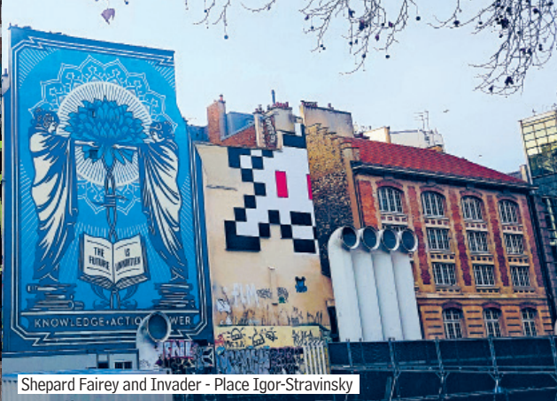
Shepard Fairey and Invader - Place Igor-Stravinsky