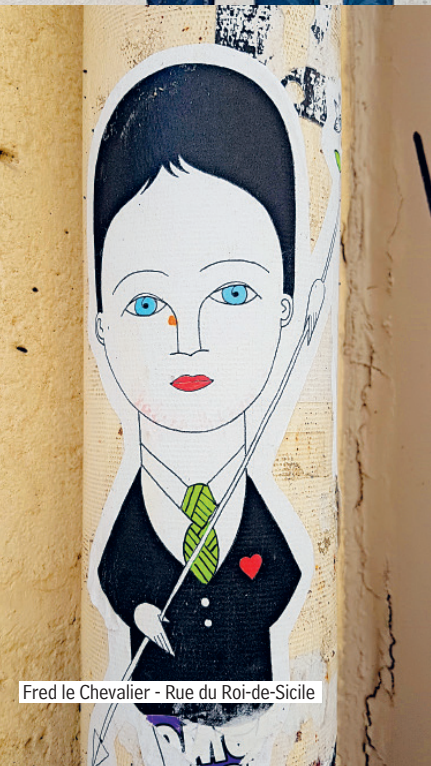
Fred le Chevalier - Rue du Roi-de-Sicile