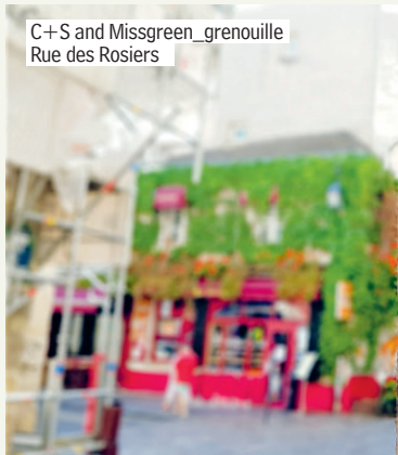
C+S and Missgreen_grenouille Rue des Rosiers