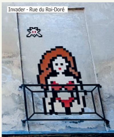
Invader - Rue du Roi-Doré

This photographer puts up stencils and stickers across the capital. His masked figures warn us about the appalling state the environment is in and the consequences for the human race.